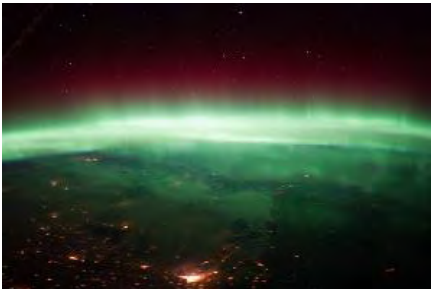
The aurora seen from the International Space Station.