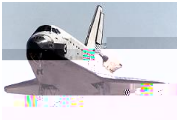
Space Shuttle Endeavour landing in 2001.

Learn more about the four forces of flight: howthingsfly.si.edu