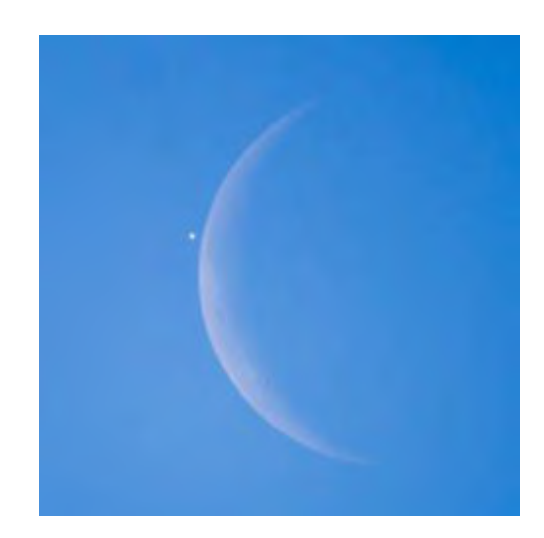
Daytime Moon and Venus Photo